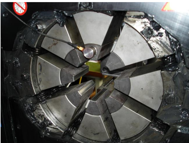
Fig. 8: Example for sensor placement

For the production of high voltage isolators ( Fig. 5 ) that shall carry heavy overhead power lines, a metallic fitting is crimped onto a fiber glass rod ( Fig. 6 ). The crimping process ( Fig. 7 ) must be well adjusted. Most important process parameters are hydraulic pressure and duration of pressurization. If the crimping pressure is too low, the mechanical joint might fail under tension. If pressure is too high, the brittle fiber glass rod might become damaged and also fail under tension.