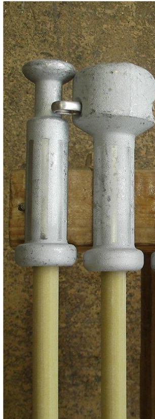
Fig. 6: Fitting on bare fiber glass rod