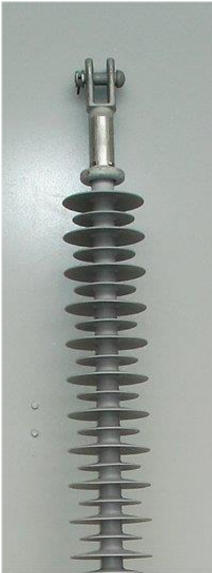
Fig. 5: High Voltage Isolator