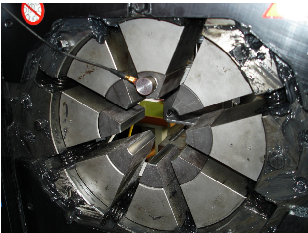
Fig. 8: Example for sensor placement

For the production of high voltage isolators ( Fig. 5 ) that shall carry heavy overhead power lines, a metallic fitting is crimped onto a fiber glass rod ( Fig. 6 ). The crimping process ( Fig. 7 ) must be well adjusted. Most important process parameters are hydraulic pressure and duration of pressurization. If the crimping pressure is too low, the mechanical joint might fail under tension. If pressure is too high, the brittle fiber glass rod might become damaged and also fail under tension.