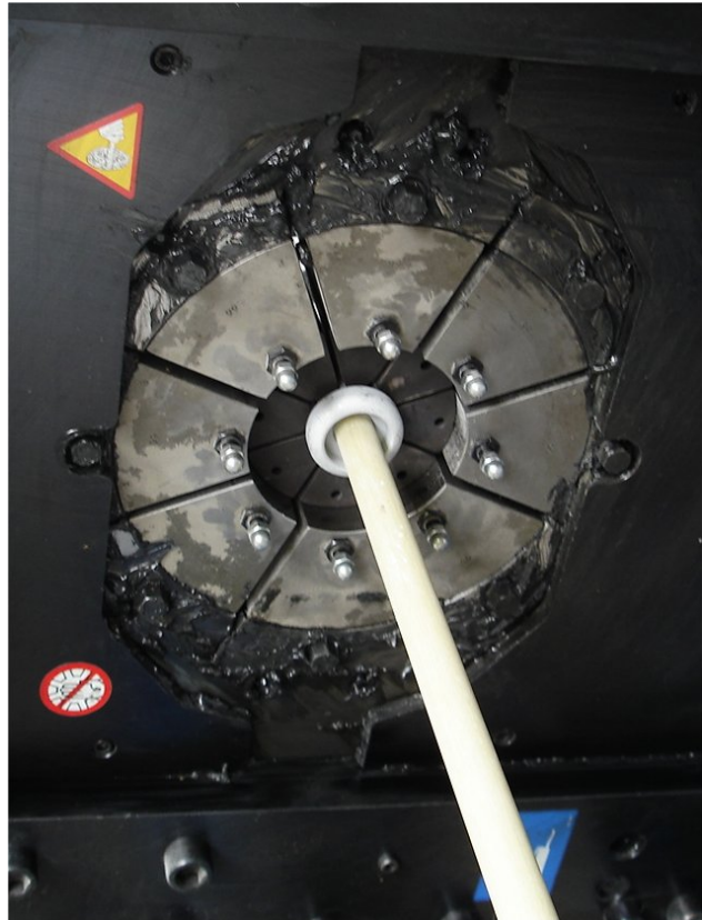
Fig. 7: Joining a fitting and a fiber glass rod by a crimping process

For the production of high voltage isolators ( Fig. 5 ) that shall carry heavy overhead power lines, a metallic fitting is crimped onto a fiber glass rod ( Fig. 6 ). The crimping process ( Fig. 7 ) must be well adjusted. Most important process parameters are hydraulic pressure and duration of pressurization. If the crimping pressure is too low, the mechanical joint might fail under tension. If pressure is too high, the brittle fiber glass rod might become damaged and also fail under tension.