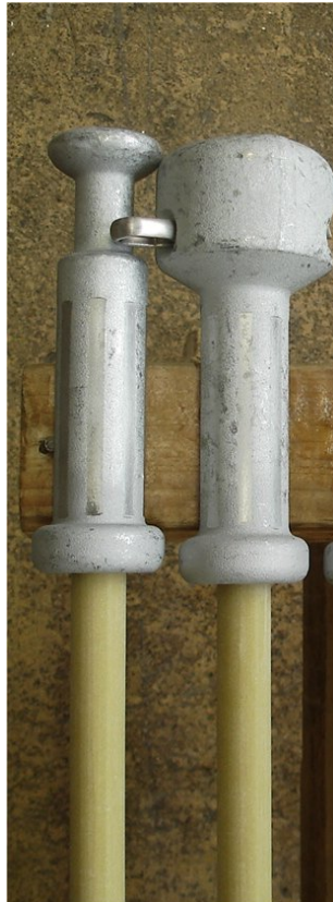
Fig. 6: Fitting on bare fiber glass rod