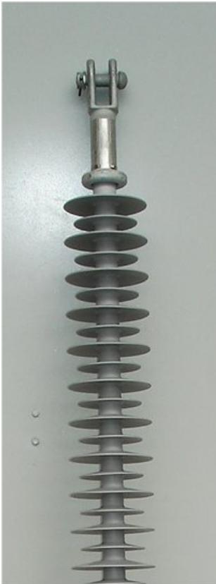
Fig. 5: High Voltage Isolator